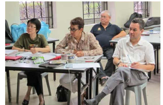
MTh(Theol) students grappling with research concepts.