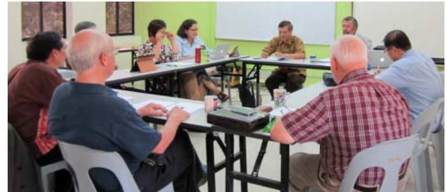
Governing Board members in session at the annual meeting