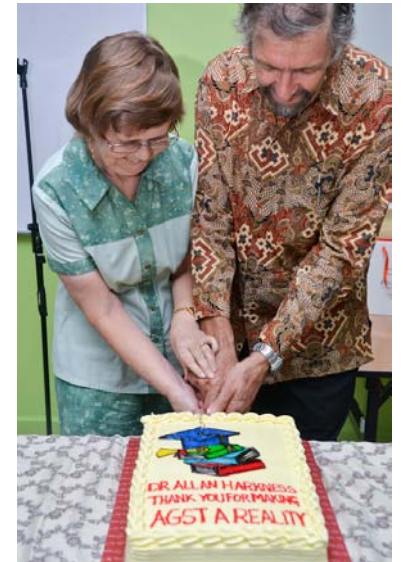
A special cake to mark the occasion was cut