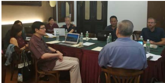
Fellow students in dialogue and contemplation.