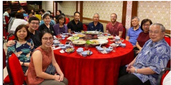
Food (and fellowship) is an important aspect of our AGST Alliance's learning process.