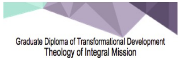
The fully online Graduate Diploma in Transformational Development program kicked off with 8 students in January 2020. This is a partnership program with World Vision International.