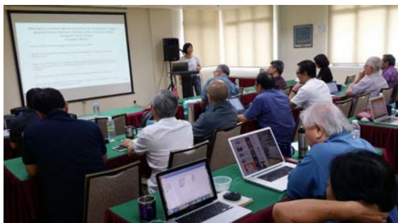
Doctoral Colloquium 2019